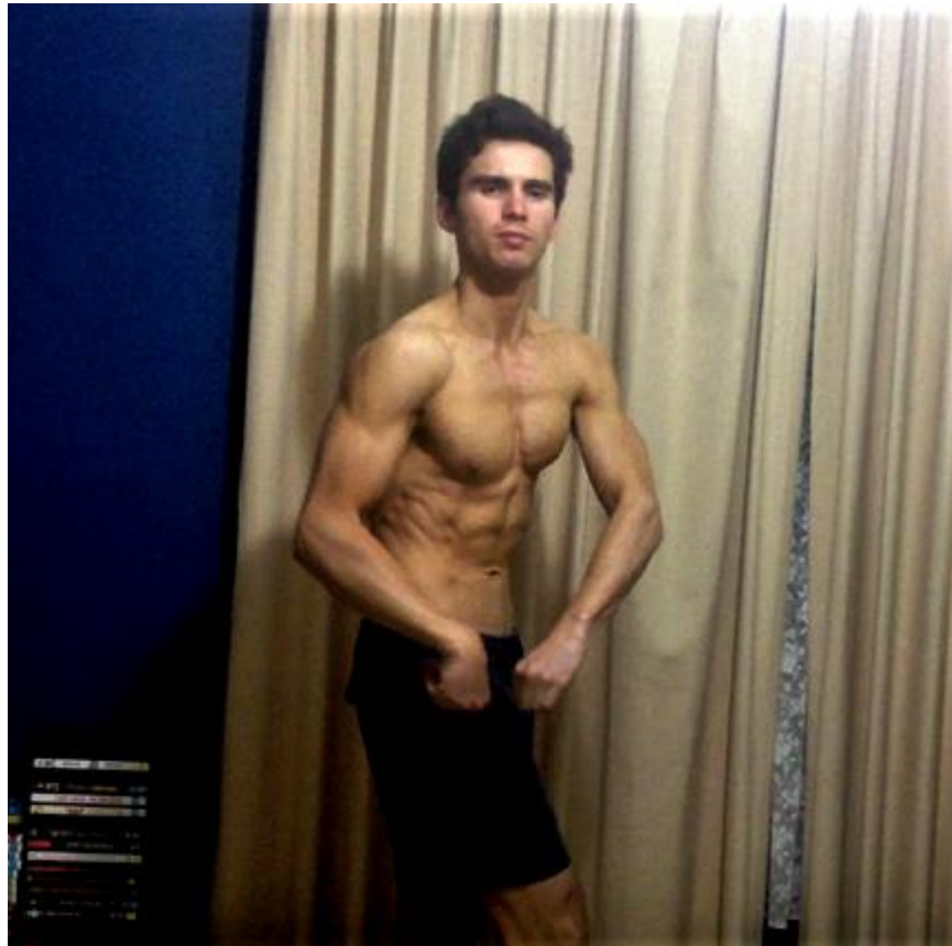
Date written – 15/6/2020 Updated – 23/12/2022